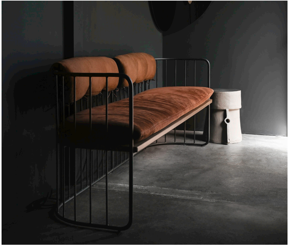
Ellipse Bench shown in Blackened Steel and Nubuck Leather.