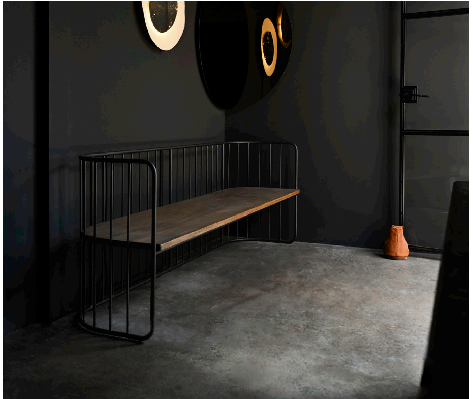
Ellipse Bench shown in White and Lemon Walnut (left), Blackened Steel and Iroko.