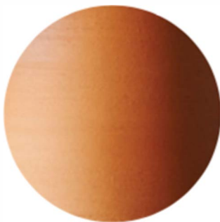
TERRACOTTA MATT CLAY BODY FINISH