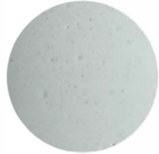
SATIN WHITE SATIN GLAZE FINISH NEW GLAZE OFFERING FOR 2019