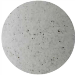
SPECKLED WHITE GLOSS GLAZE FINISH