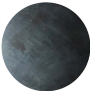
CHARCOAL MATT GLAZE FINISH