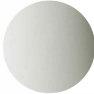
PURE WHITE GLOSS GLAZE FINISH