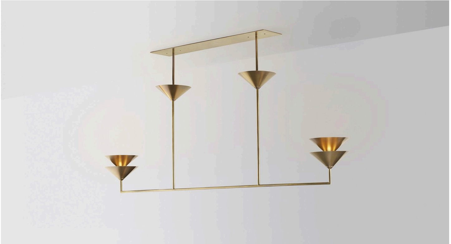
Balanced Stack shown in Aged Brass finish.