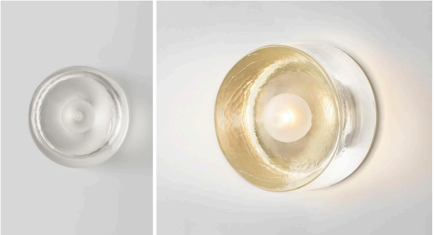
Cast Glass Anton Mini with White Mount (L), shown with Brass Mount (R).