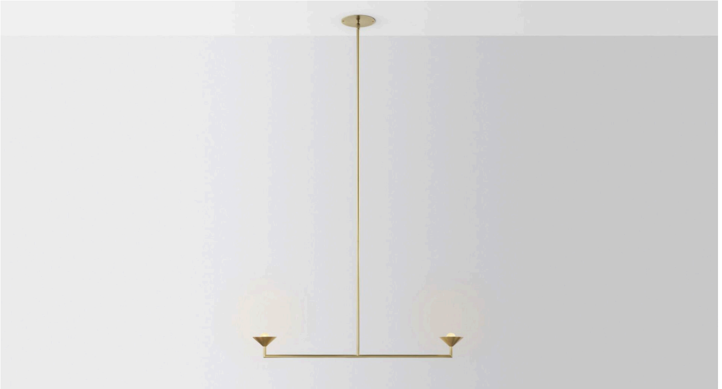
Double Drop shown in Brushed Brass finish.