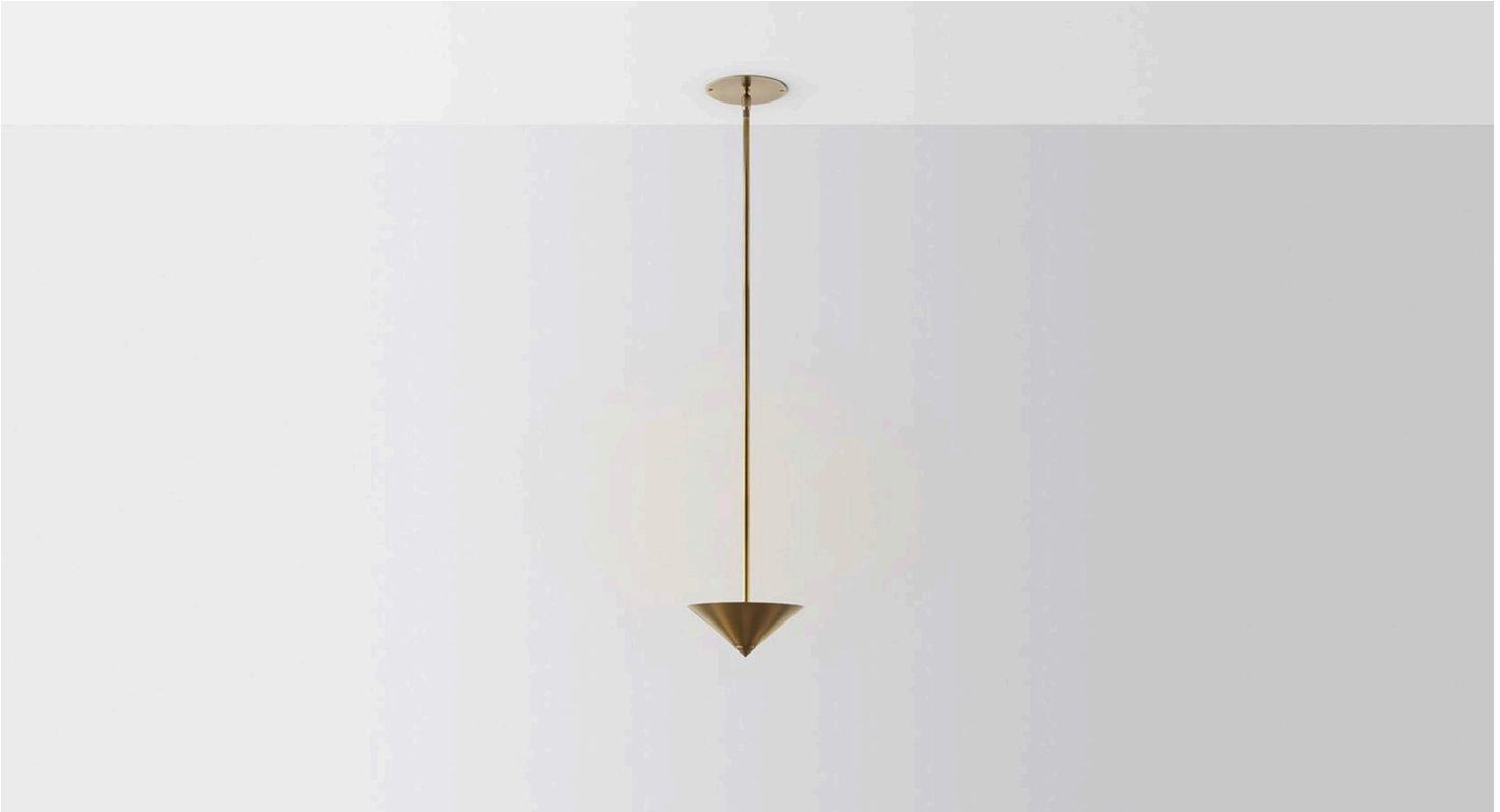
Drop Stack 1 shown in Aged Brass finish.