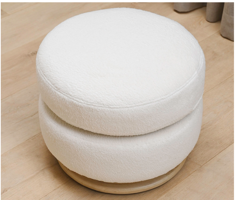
Maas Ottoman shown in Tattood Leather and Iroko (left), Cotton and White Oak (right).