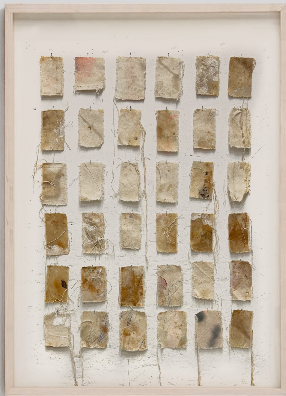
Armando Mesías , (Colombia, 1985) DESCARTES GAVE AS GOOD AS ANSWER AS ANY , 2022 90cm x 60cm $8,500