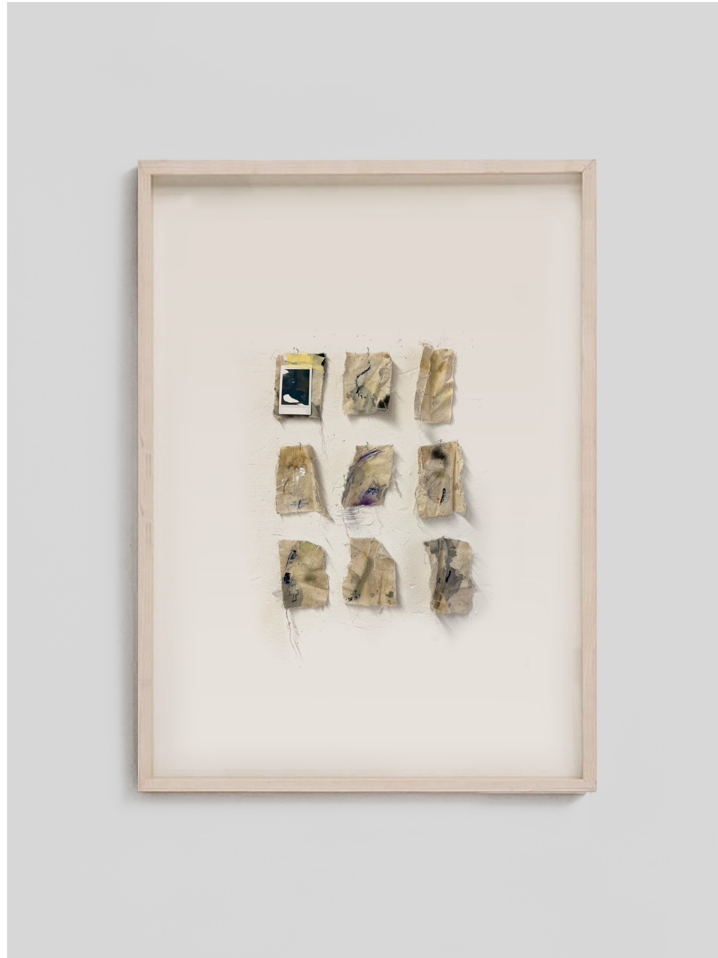
Armando Mesías , (Colombia, 1985) WITH EMPTY PANGOSSIAN OPTIMISM, 2022 90cm x 60cm $8,500