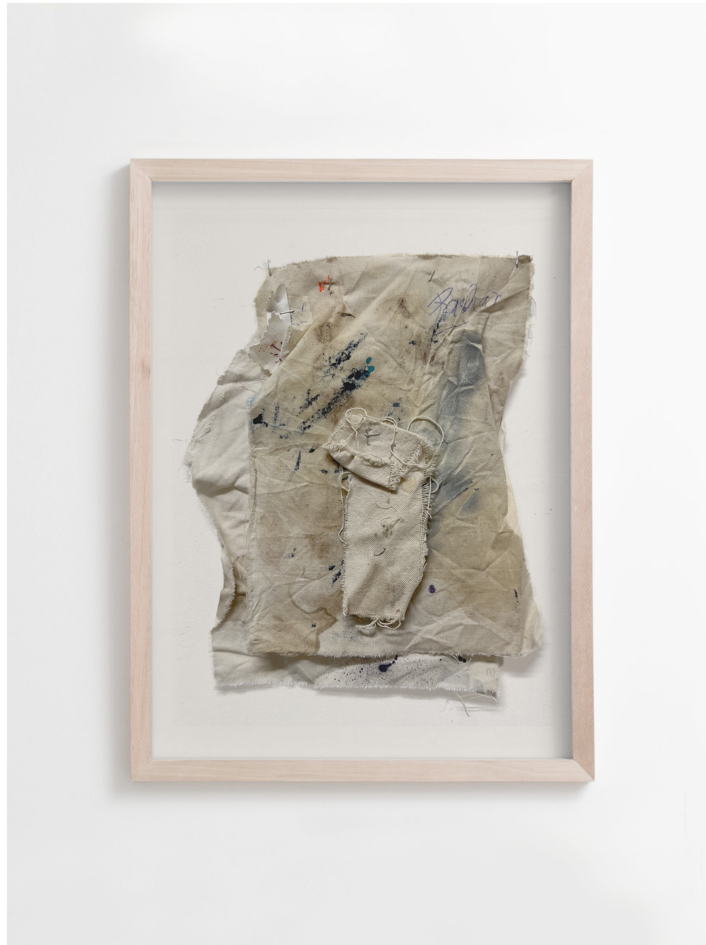
Armando Mesías , (Colombia, 1985) THE WAR ON JOKES , 2022 45cm x 30cm $4800