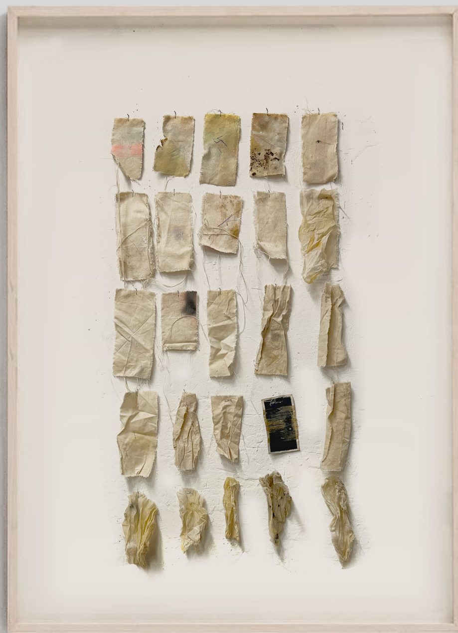
Armando Mesías , (Colombia, 1985) NÃO EXISTE NENHUMA INSANÁVEL CONTRADIÇÃO ENTRE ESTÉTICA E AUTORIDADE , 2022 120cm x 80cm $11,200