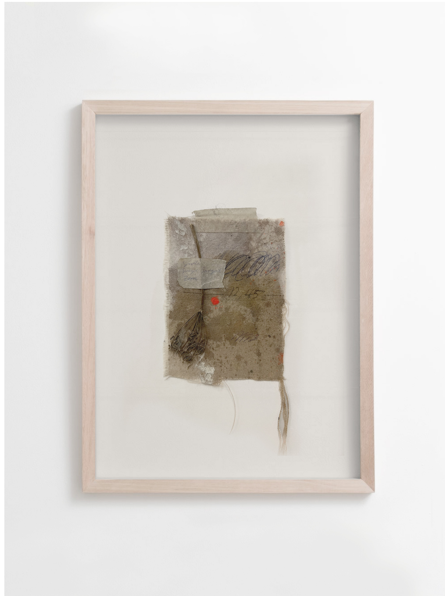
Armando Mesías , (Colombia, 1985) WHEN ELEPHANTS FIGHT , 2022 45cm x 30cm $4800