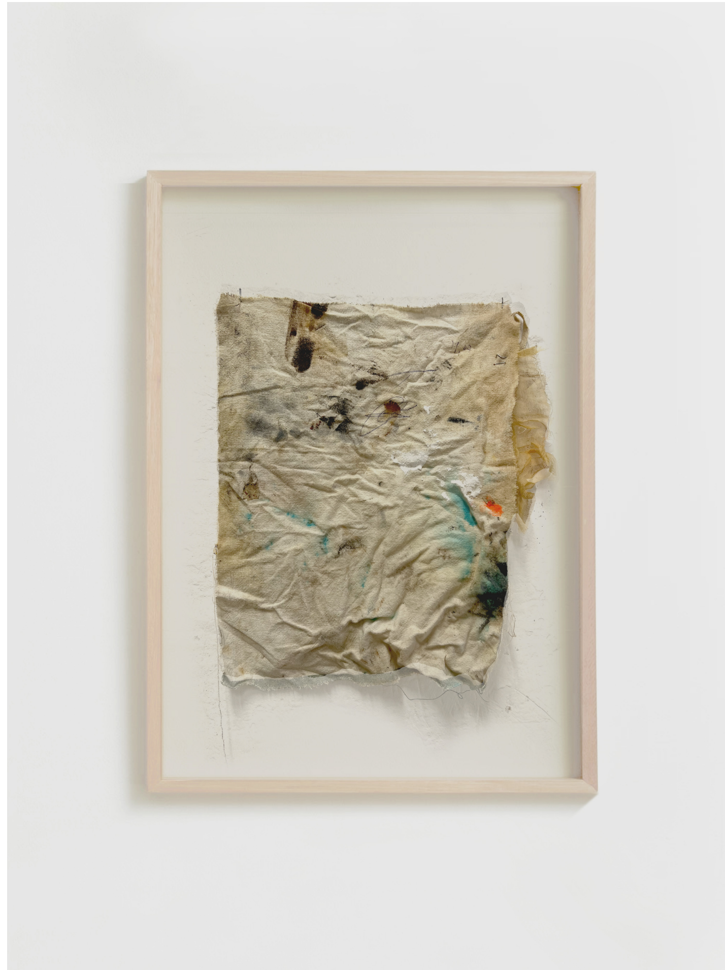
Armando Mesías , (Colombia, 1985) CERTAINLY, AN IDEOLOGY OF AN AFTERLIFE HELPS , 2022 60cm x 40cm $6,250