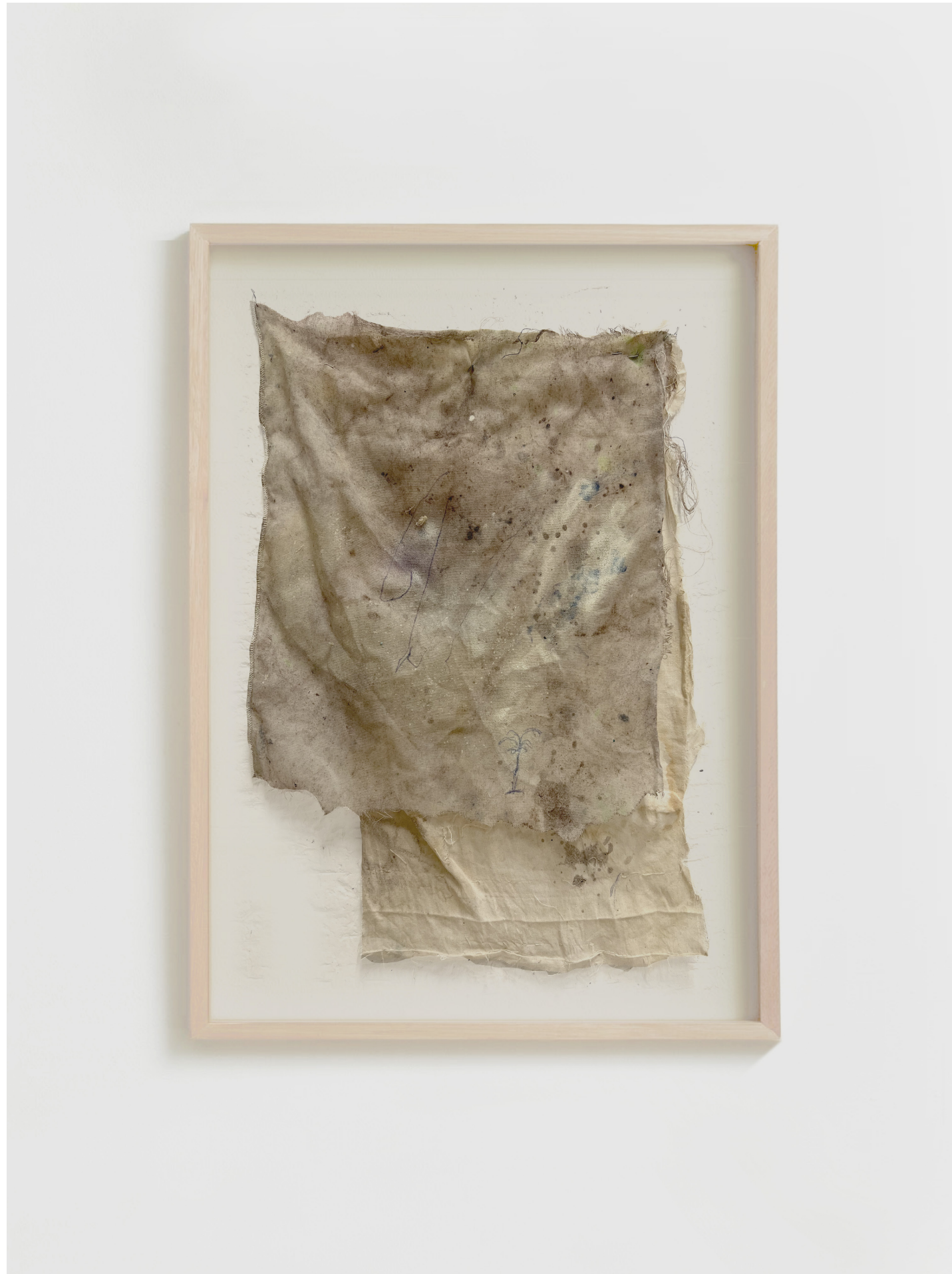
Armando Mesías , (Colombia, 1985) MANAGING INTRUSIVE THOUGHTS , 2022 60cm x 40cm $6,250