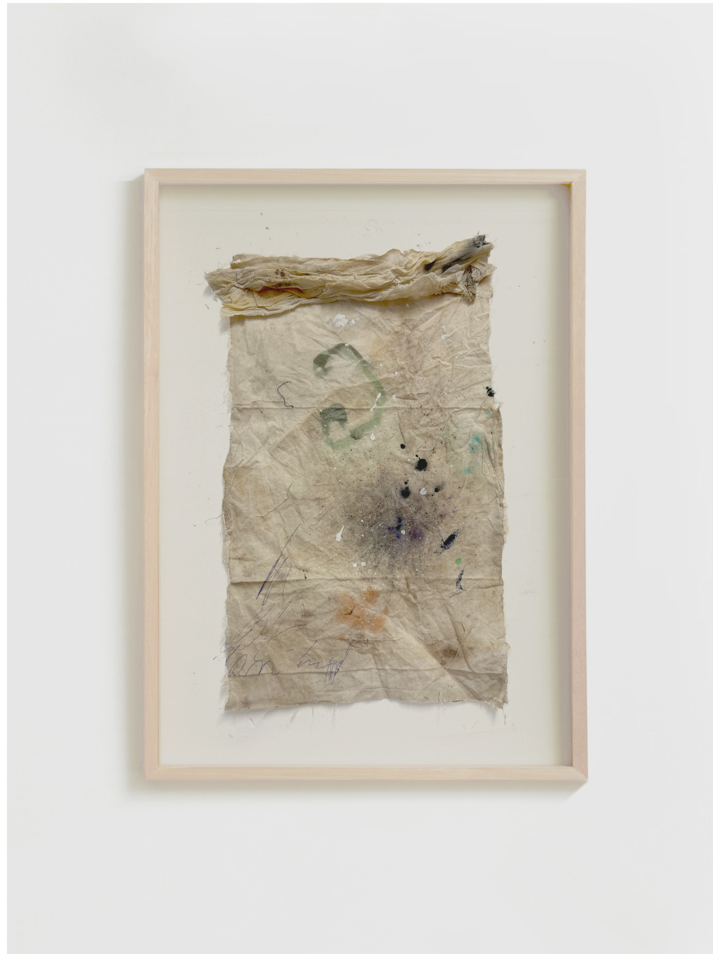
Armando Mesías , (Colombia, 1985) SÍ, PERO TENDRÍA QUE USTED HABERLA VISTO ANTES DE LA GUERRA, 2022 60cm x 40cm $6,250