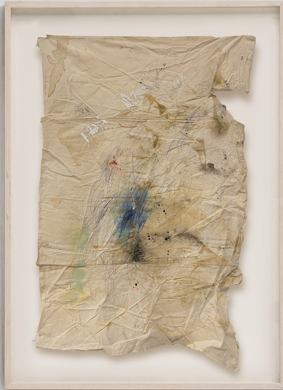
Armando Mesías , (Colombia, 1985) ABUSE OF POWER COMES AS NO SURPRISE , 2022 120cm x 80cm $11,200