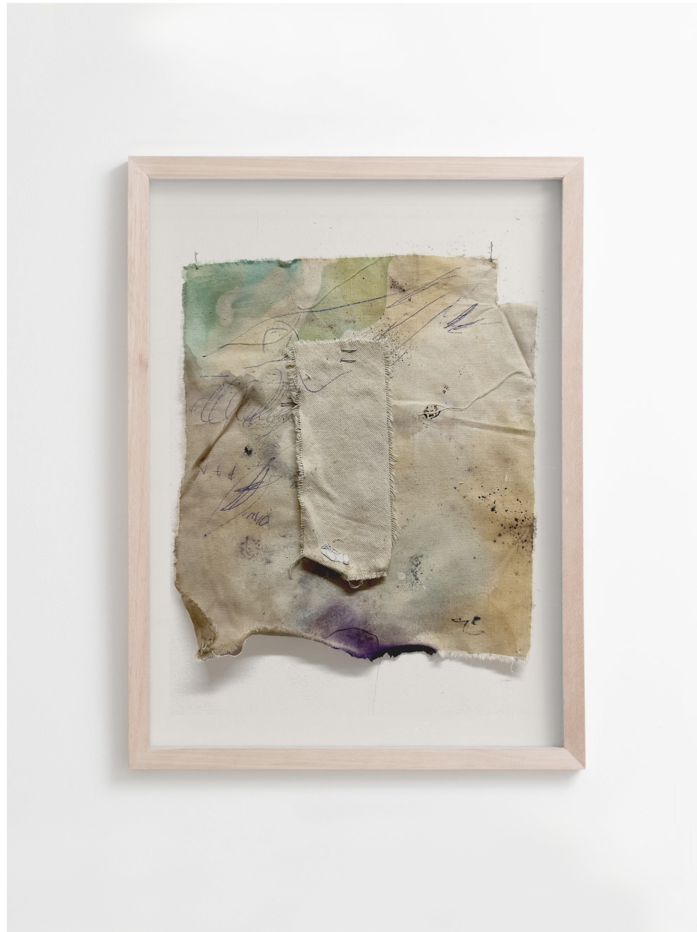
Armando Mesías , (Colombia, 1985) BERLIN FRINGE , 2022 45cm x 30cm $4800