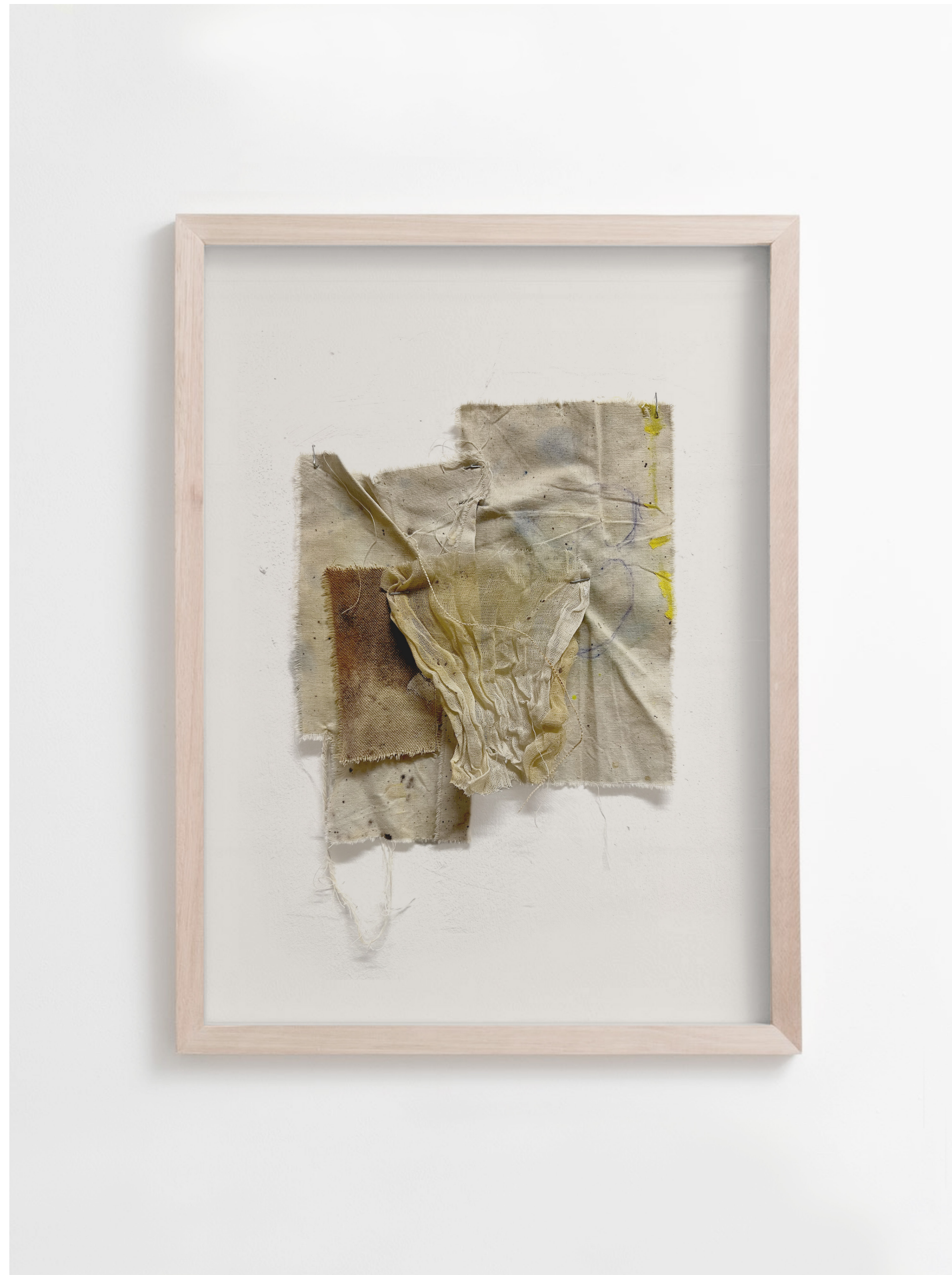
Armando Mesías , (Colombia, 1985) BAD MEN DO WHAT GOOD MEN DREAM , 2022 45cm x 30cm $4800