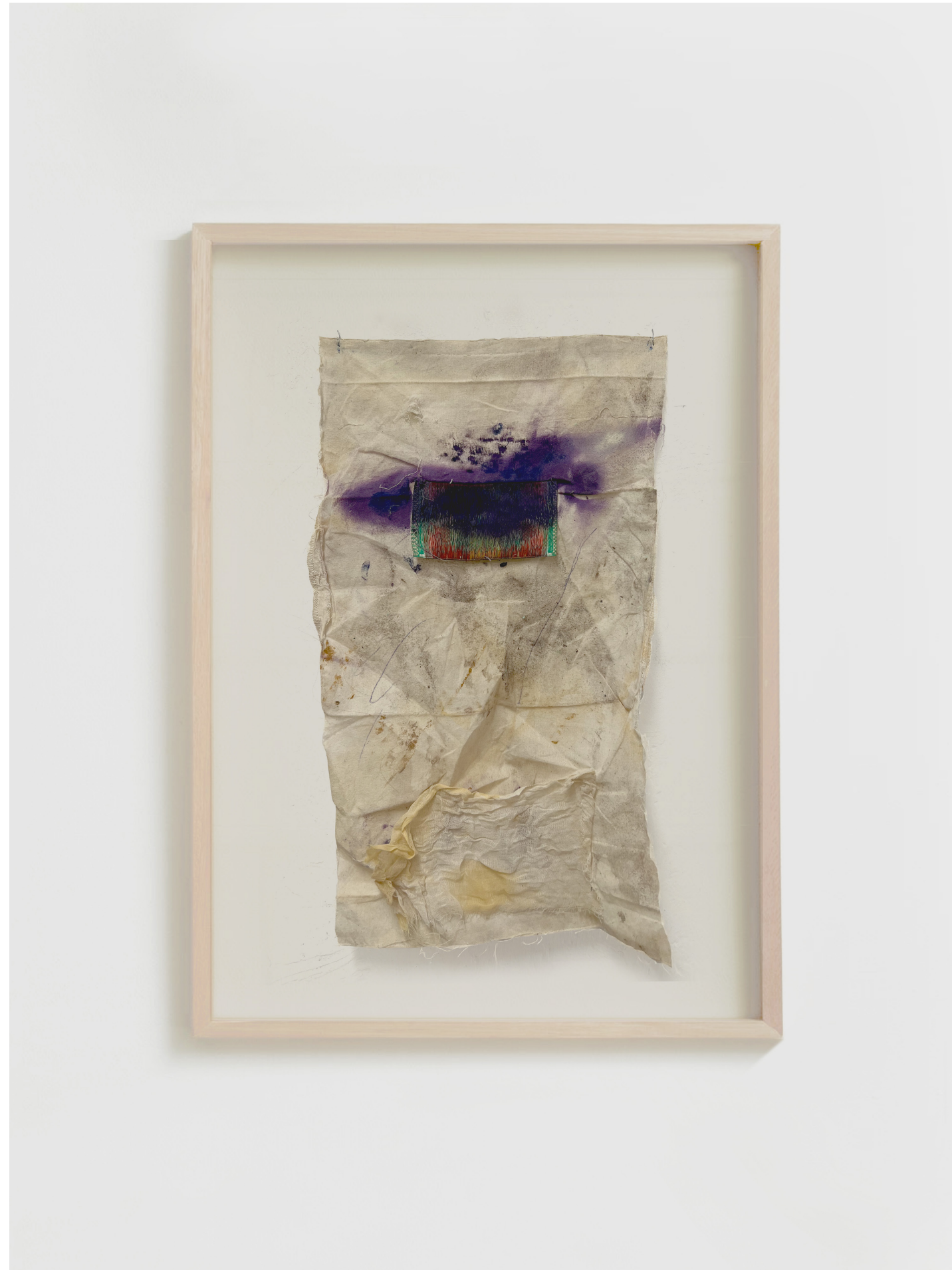
Armando Mesías , (Colombia, 1985) HOLY WATER IN A COKE BOTTLE , 2022 60cm x 40cm $6,250