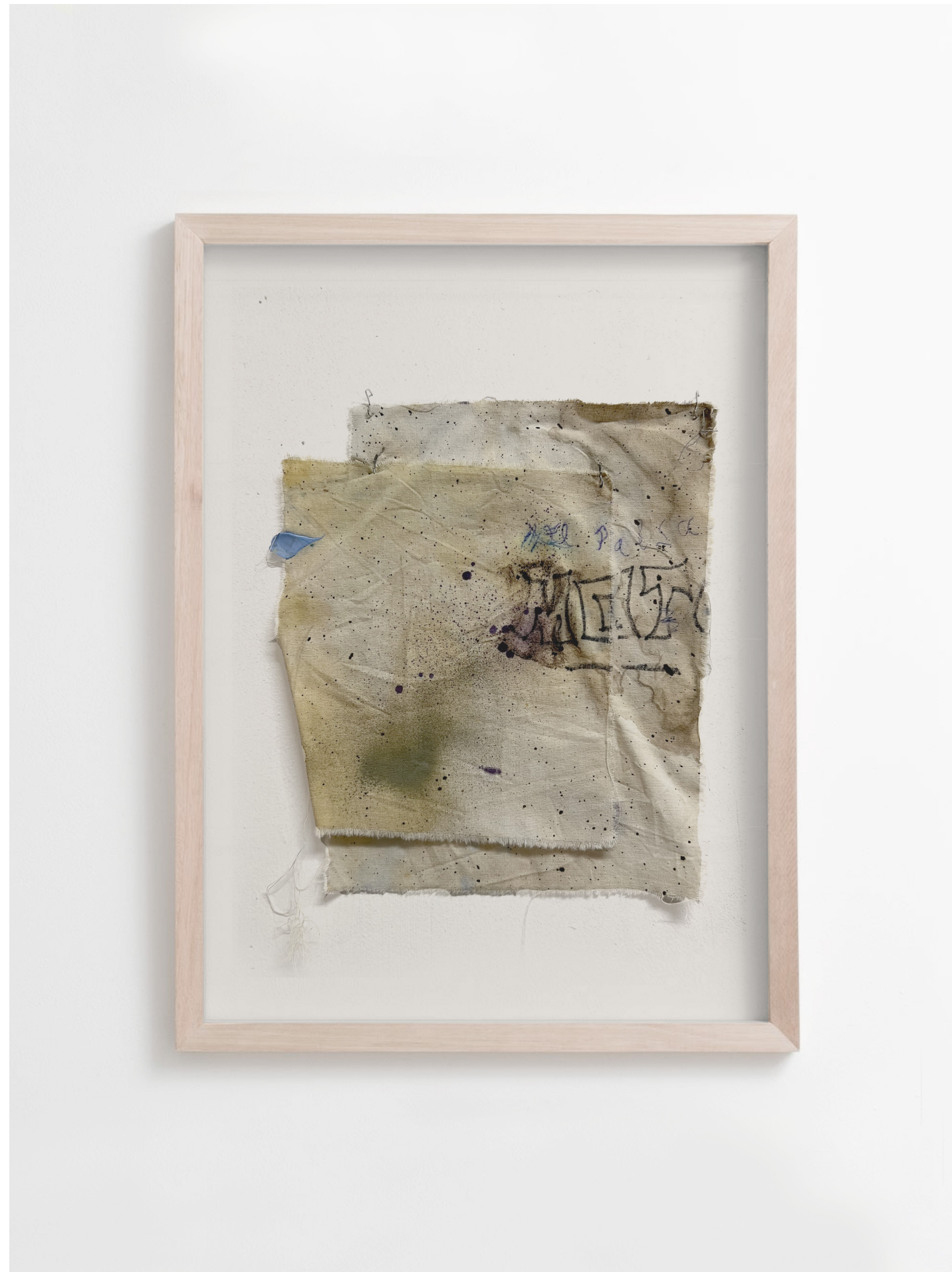
Armando Mesías , (Colombia, 1985) THE NOT-SO-LONG PEACE , 2022 45cm x 30cm $4800