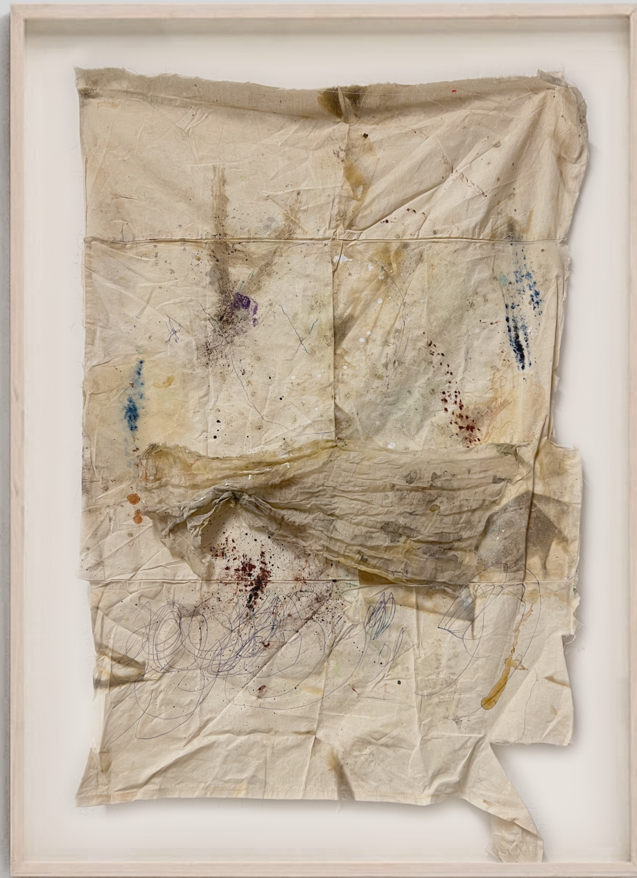
Armando Mesías, (Colombia, 1985) BENIGN MASOCHISM IN CONTEMPORARY PRACTICE, 2022 120cm x 80cm $11,200