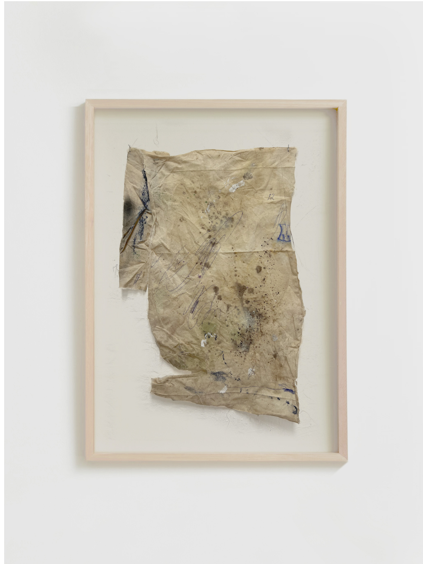
Armando Mesías, (Colombia, 1985) DEFIANT JAZZ , 2022 60cm x 40cm $6,250