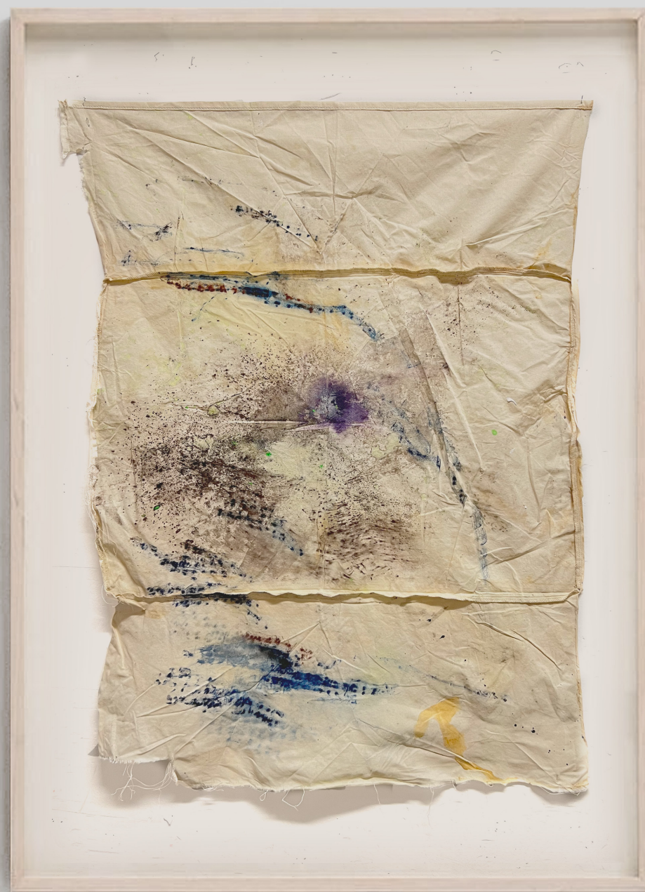
Armando Mesías , (Colombia, 1985) THE LOGIC OF RAGE , 2022 120cm x 80cm $11,200