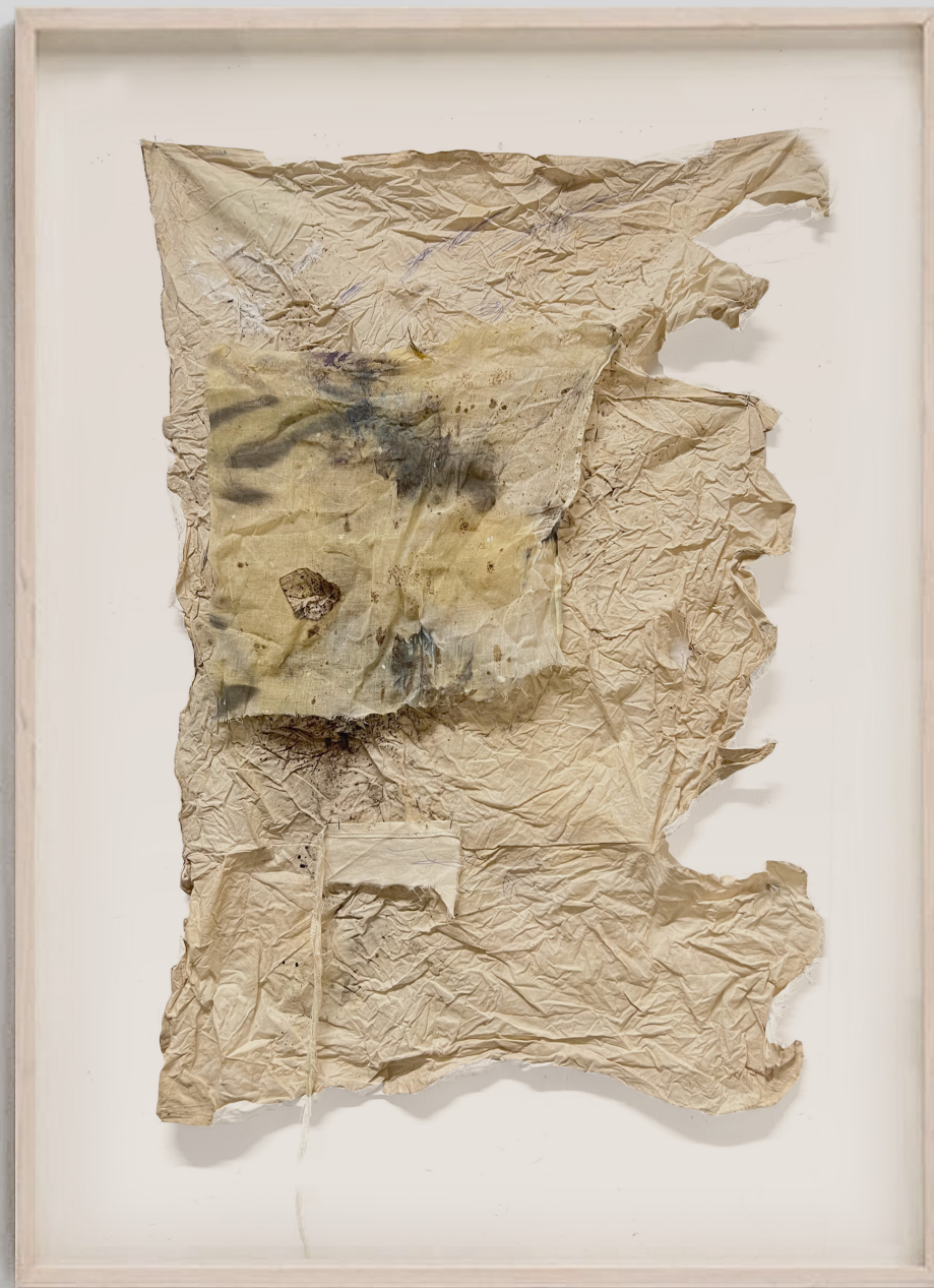
Armando Mesías , (Colombia, 1985) ABUSE OF POWER COMES AS NO SURPRISE , 2022 120cm x 80cm $11,200