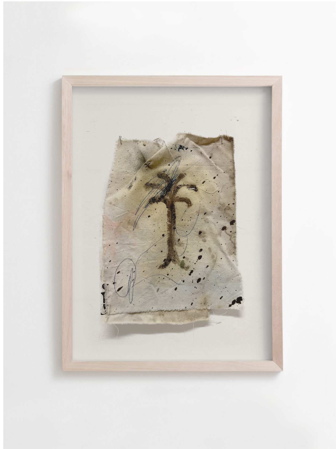
Armando Mesías , (Colombia, 1985) DEATH BY BLACK HOLE / BLACK HOLE BLUES , 2022 45cm x 30cm $4800