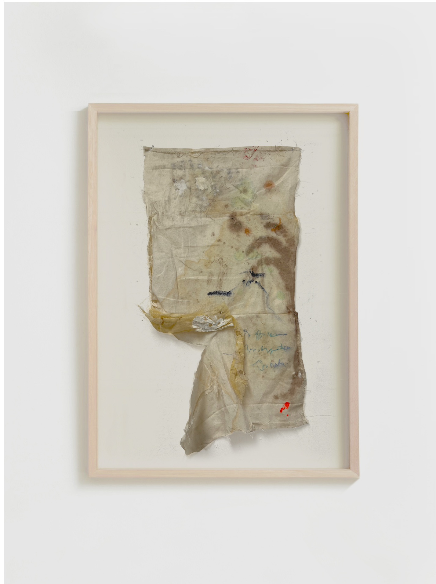
Armando Mesías , (Colombia, 1985) NAH, CALLING IT 'YOUR JOB' DOESN'T MAKE IT RIGHT, BOSS, 2022 60cm x 40cm $6,250