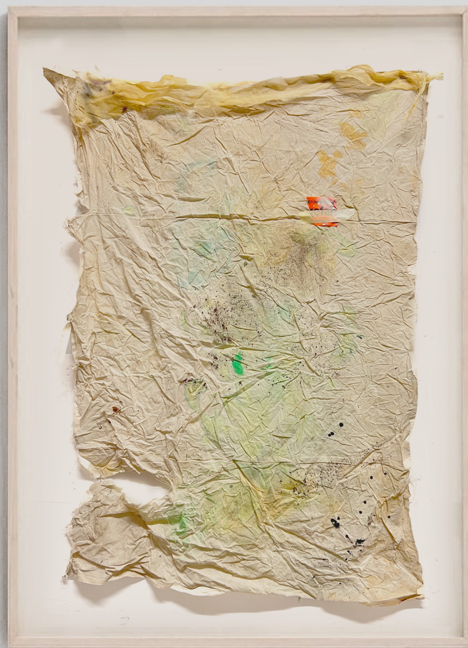
Armando Mesías , (Colombia, 1985) STREICHHOLZ UND BENZINKANISTER , 2022 120cm x 80cm $11,200