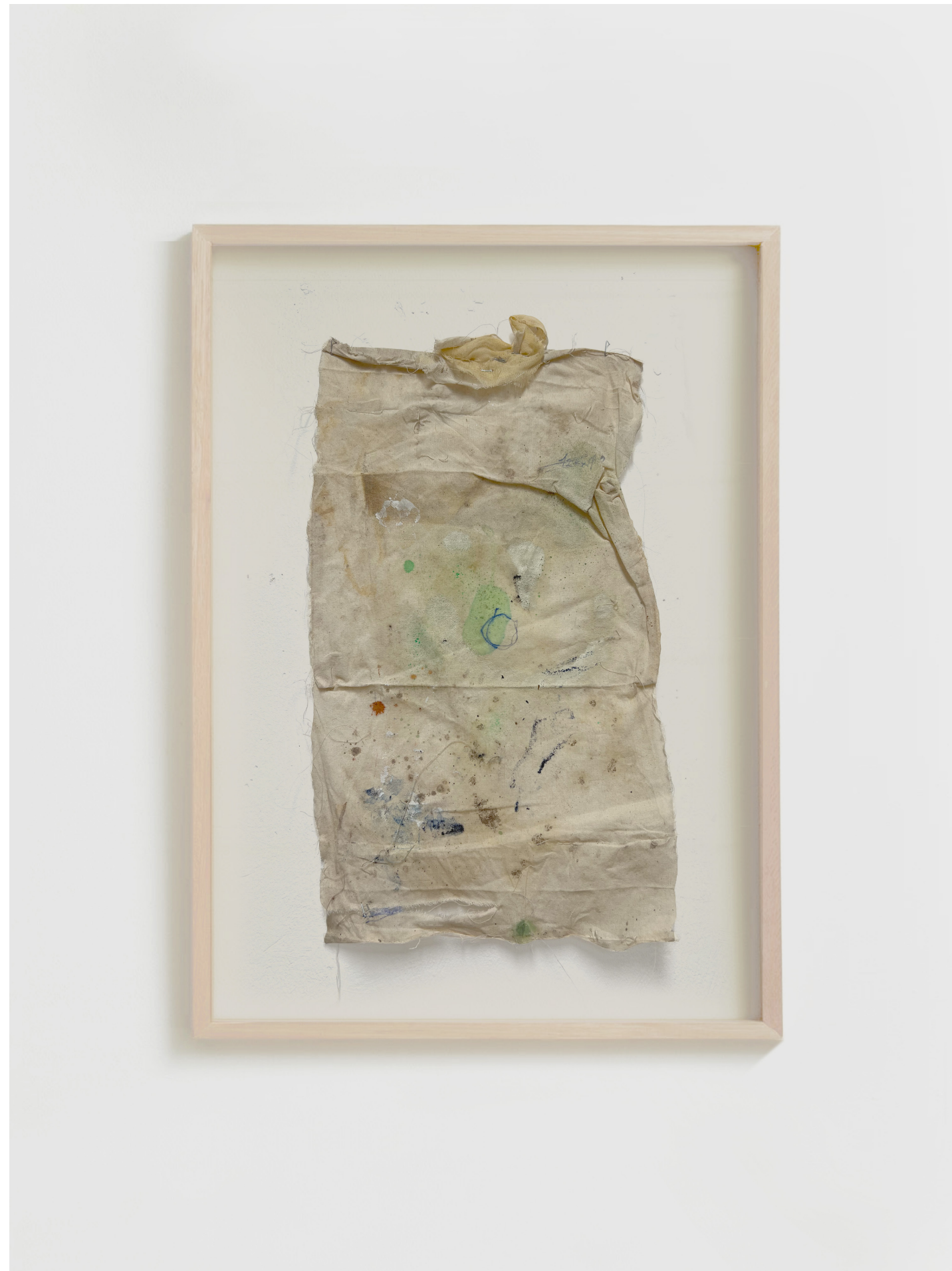
Armando Mesías, (Colombia, 1985) QUÉ BELLA ESTÁ LA LUNA ESTA NOCHE, 2022 60cm x 40cm $6,250