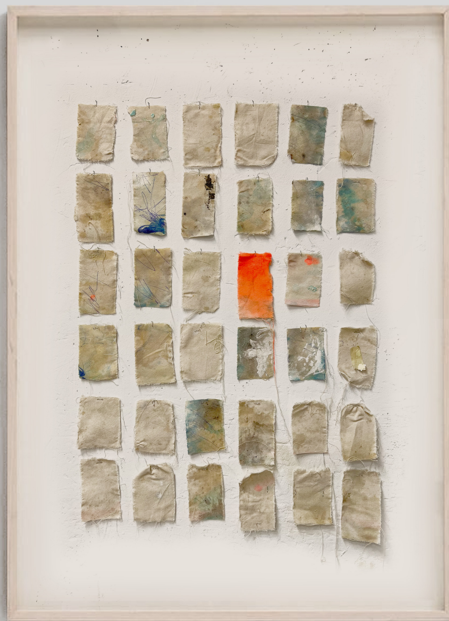
Armando Mesías, (Colombia, 1985) SILOÉ , 2022 120cm x 80cm $11,200