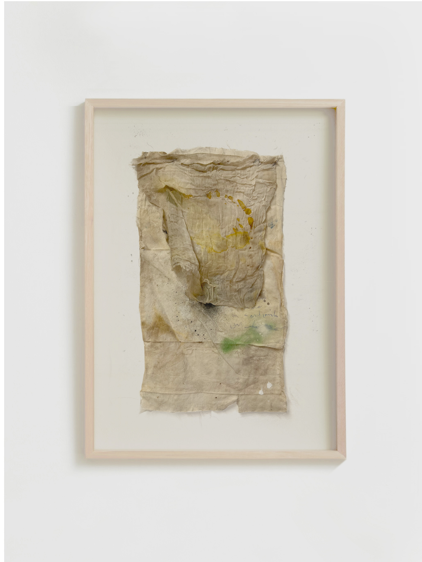
Armando Mesías, (Colombia, 1985) FUNNY HOW TARGET POTENTIAL BECAME A STATUS SYMBOL AMONG US, 2022 60cm x 40cm $6,250