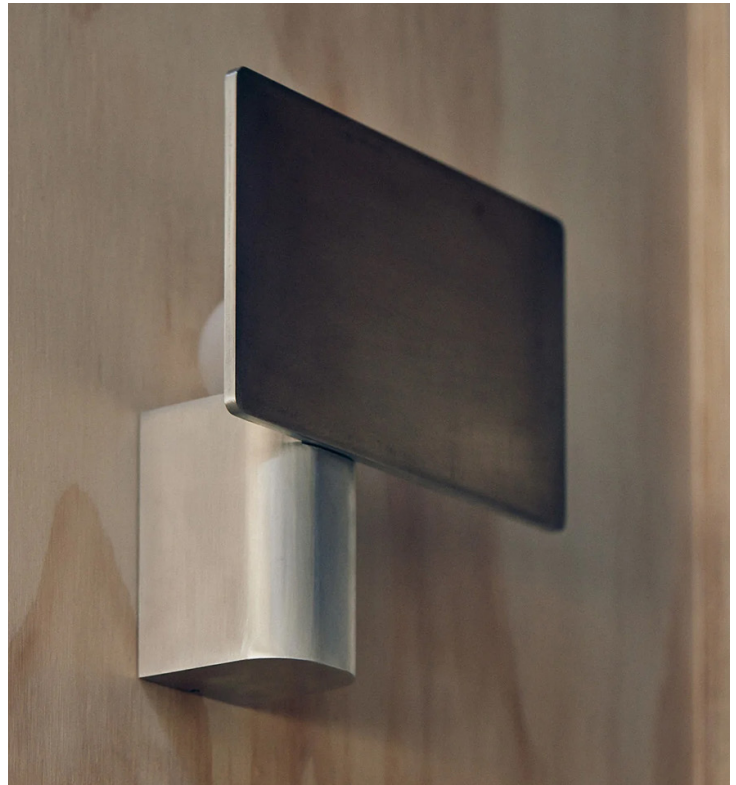
Shield Wall Lamp Horizontal shown in Aluminum.