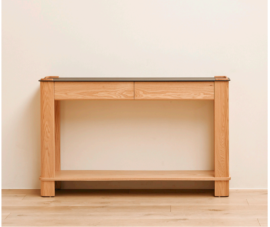
Rollen Console shown in Custom Lacquered Red Oak, Blackened Steel Top.