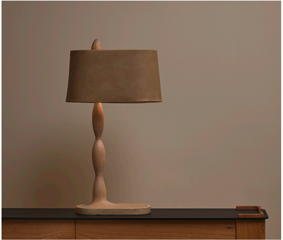
Trager Table Lamp shown in Custom Maple, Travertine, and Leather.