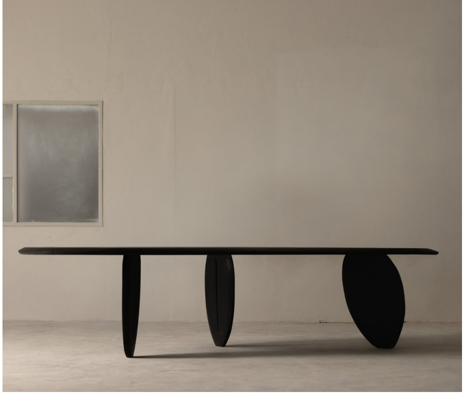
Balanced Void Dining Table shown in Charred Iroko. Designed by Vasco Mendes.