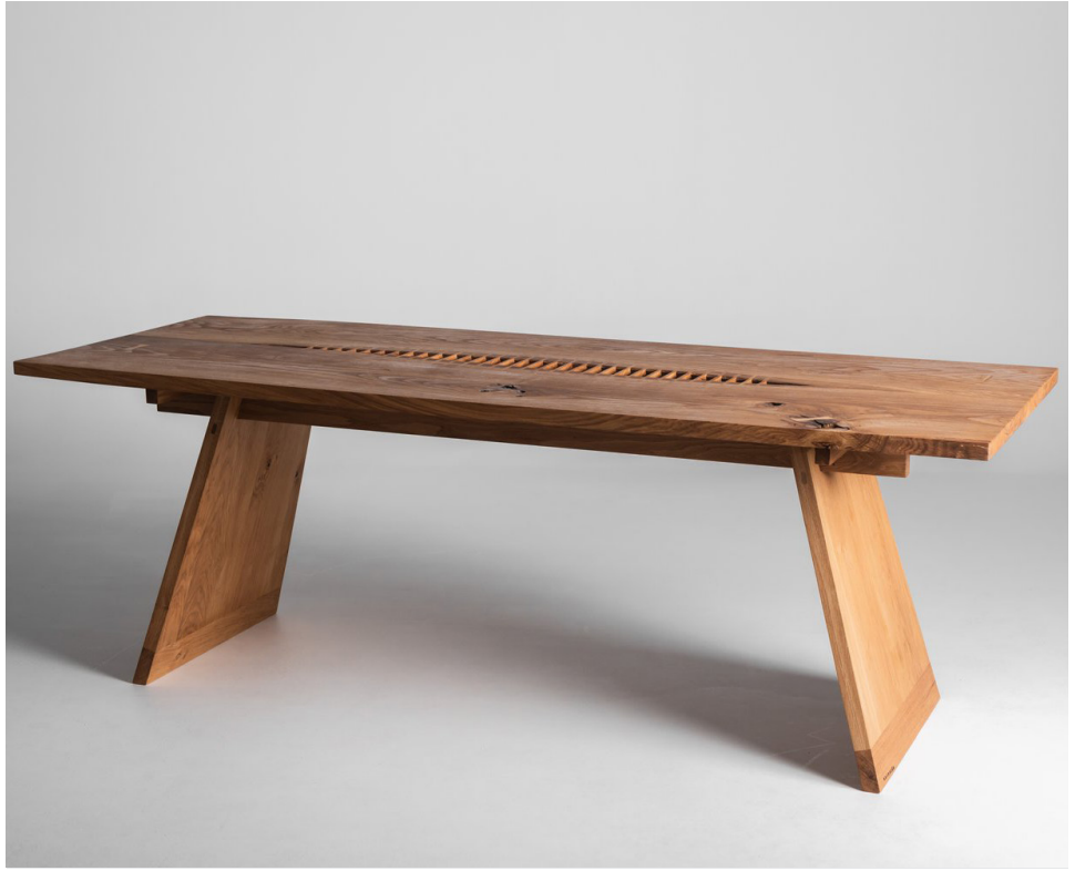
Stitch Up Dining Table shown in French Oak. Designed by Vasco Mendes.