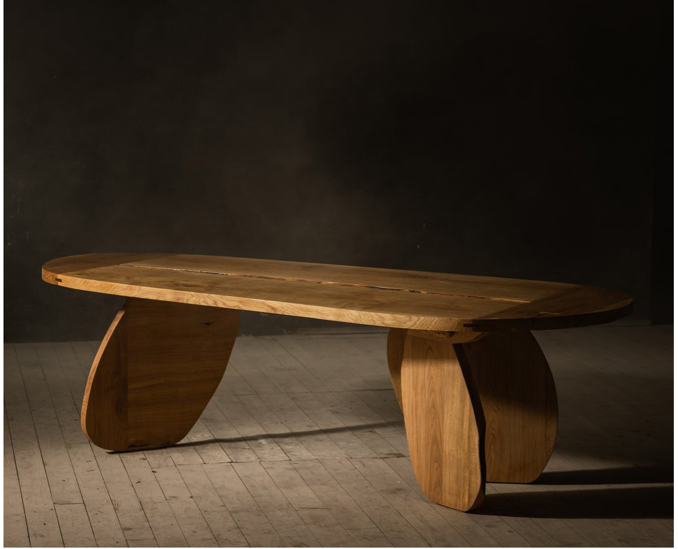
Void Dining Table shown in French Oak. Designed by Vasco Mendes.