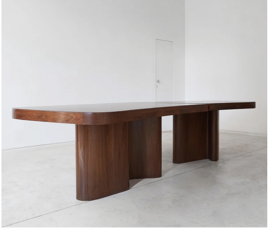
Camur Two Part Table shown in Teak Veneer. Designed by Florence Louisy for Aequo.