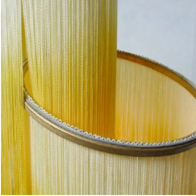
(A) Yellow / Light Yellow

Available Fringe Finishes: DIP-DYED | SOLID