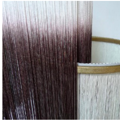
(E) Brown / Off-White