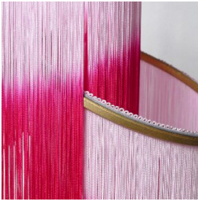
(D) Reddish Pink / Light Pink