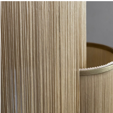
(F) Beige Gold