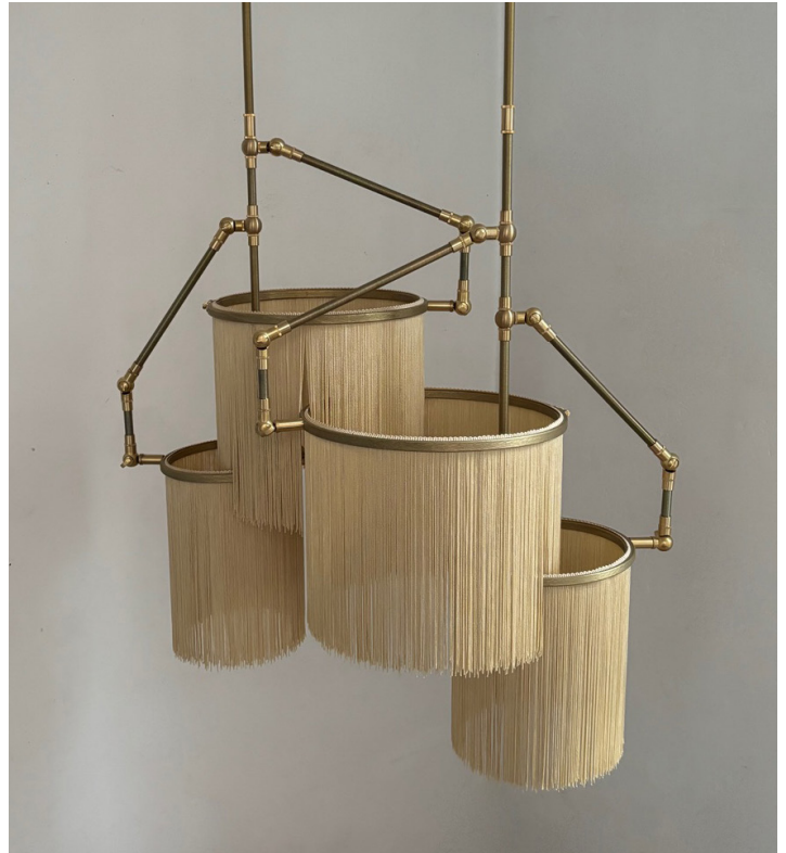
No. 31 Pendant shown in Solid Dark Beige (Left), Solid Beige Gold (Right). Designed by Sander Bottinga.