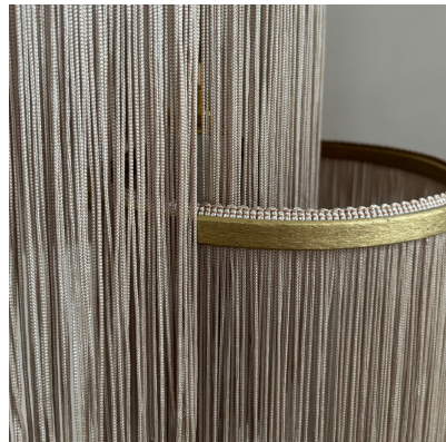
(G) Dark Beige