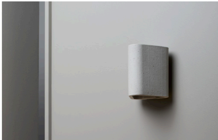
Ridge - Chalk