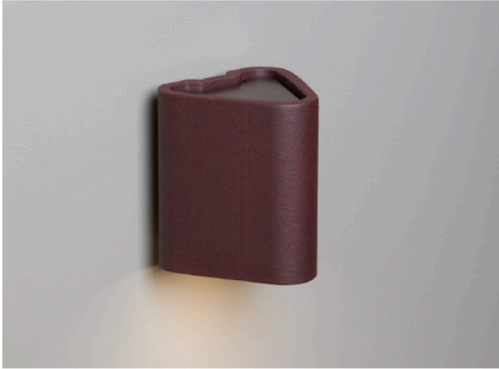
Ridge - Iron Ore