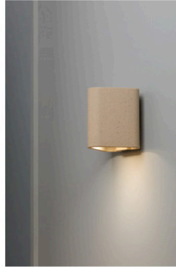
Ridge - Sand