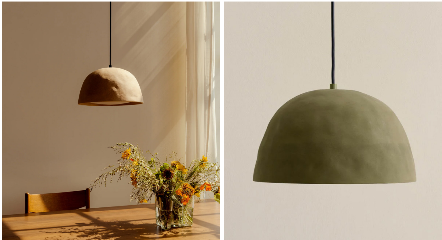
Dome Pendant in Tan Clay (Left) & Green Clay (Right)

stahlandband.com info@stahlandband.com 424.228.4134