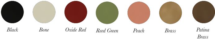
Black Bone Oxide Red Reed Green Peach Brass Patina Brass