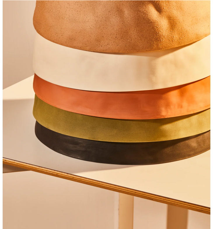
Dome Table Lamp Tan Clay (Left) & Available Color Shades (Right)