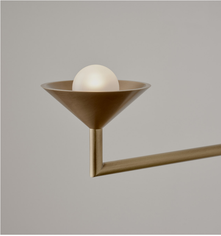
Double Drop shown in Aged Brass finish, designed by Völker Haug Studio.