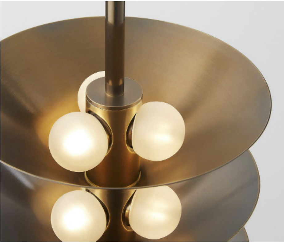
Drop Stack Cluster shown in Aged Brass finish, designed by Volker Haug Studio.