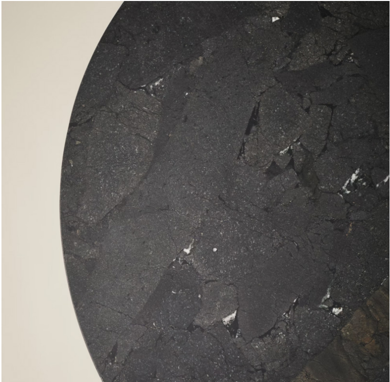
Eight Side Table with Stone Top, designed by Veermakers.