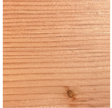
Raw Douglas Fir