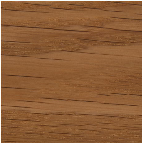
Oiled White Oak