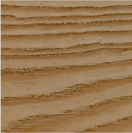
Sand Blasted Ash