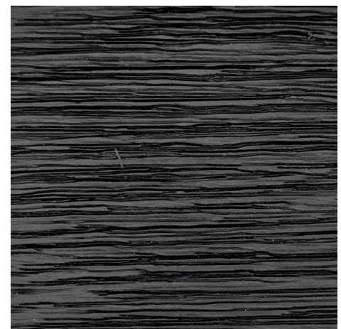
Charred Red Oak