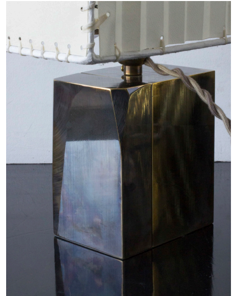
Series 03 Table Lamp - Solid machined and sculpted "smoke" acid patinated brass base, hand-stitched goatskin parchment shade, and hand-dyed braided cotton cord.