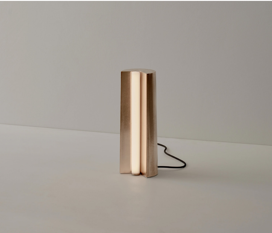
Tableton Tall shown in Gunmetal, designed by Volker Haug Studio.