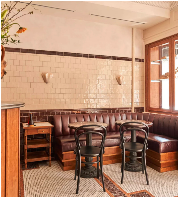
Vera Sconce in Cherry (Left) & Almond (Right)