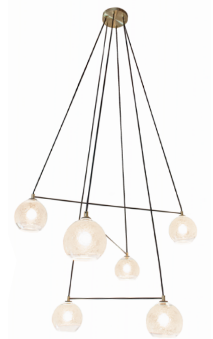
6 light clear round bubble crossbar lengths 2', 3', and 4' 56-90-129-6A 4.5' minimum drop as shown