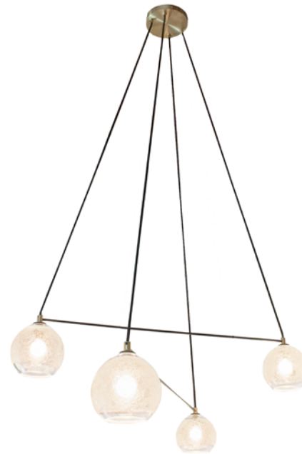
4 light clear round bubble crossbar lengths 4' 56-90-129-4A 4.5' minimum drop as shown