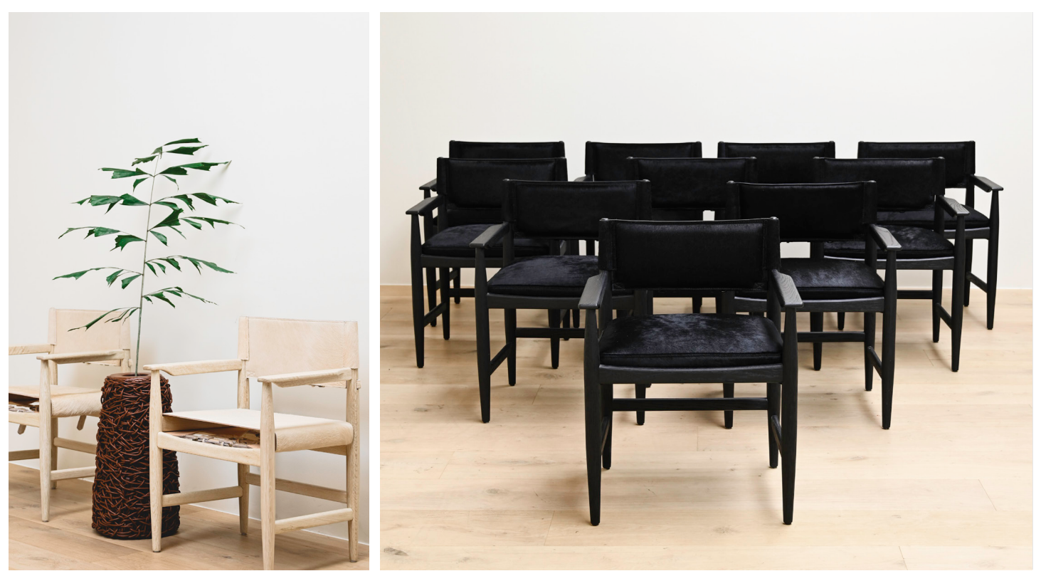
Campaign Leather Dining Armchair shown in Ash (left), Charred Red Oak (right).