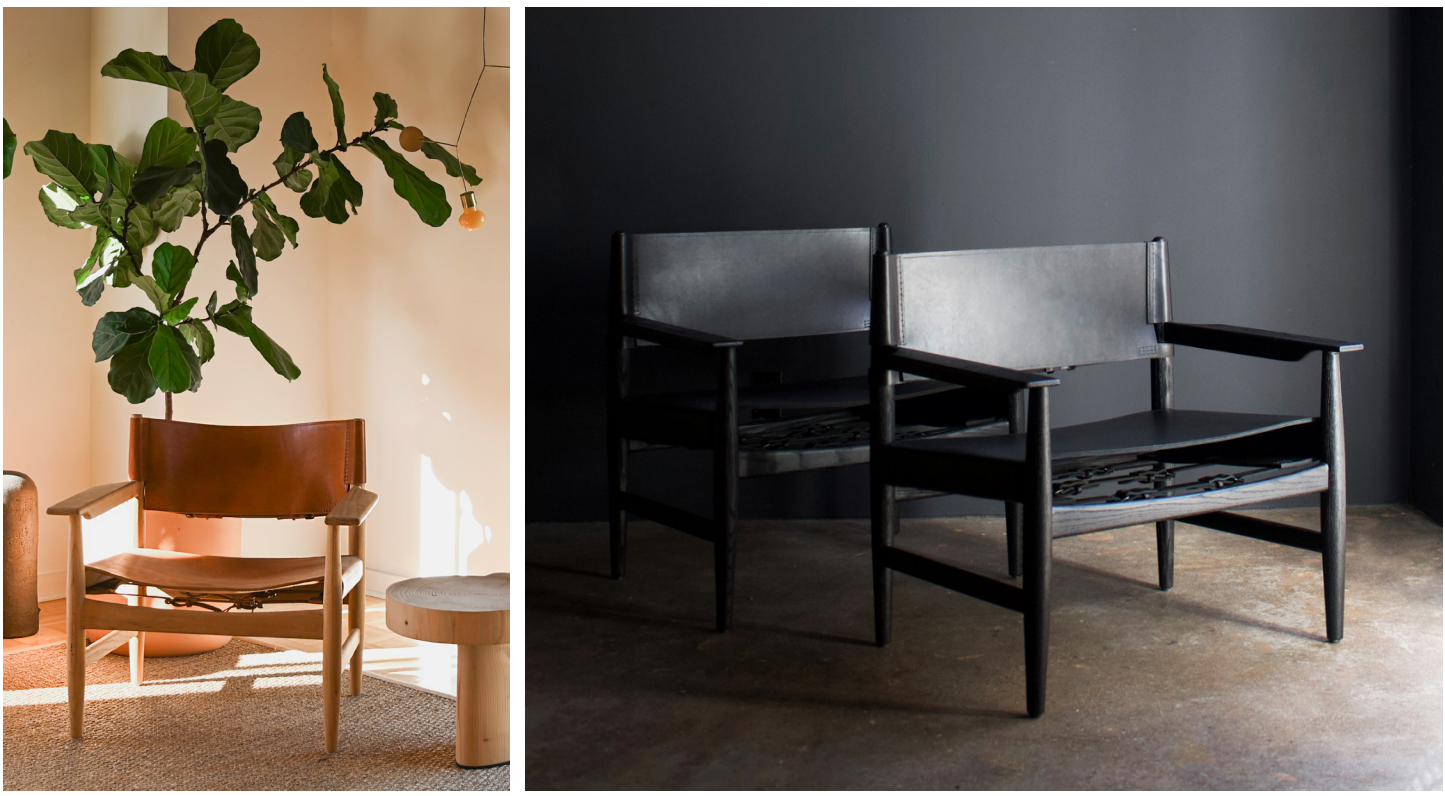
Campaign Lounge Chair shown in Ash and Cognac (left), Charred Red Oak and Black (right).