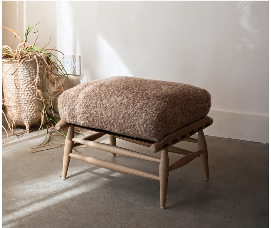
Strapping Ottoman shown in White Oak and Linen (left), White Oak and Boucle (right).