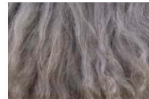
TL148 Portobello Tibetan Lambswool/Wool