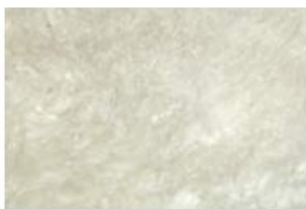
TL21 Natural Tibetan Lambswool/Wool