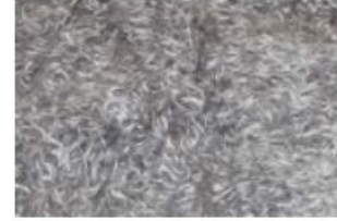
TL01 Grey Tibetan Lambswool/Wool