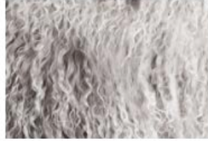
TL46 Silver Grey Tibetan Lambswool/Wool