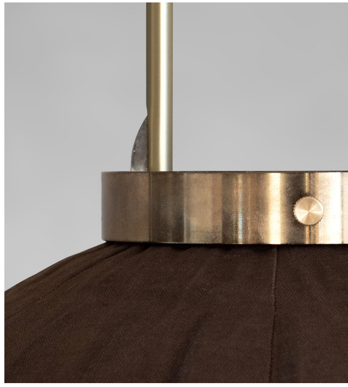
Bucket Lantern shown in Shoulang.