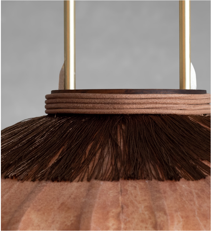
Bucket Lantern shown in Tu.