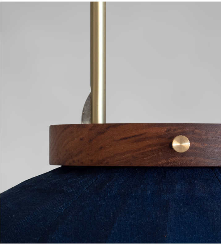
Bucket Lantern shown in Indigo.