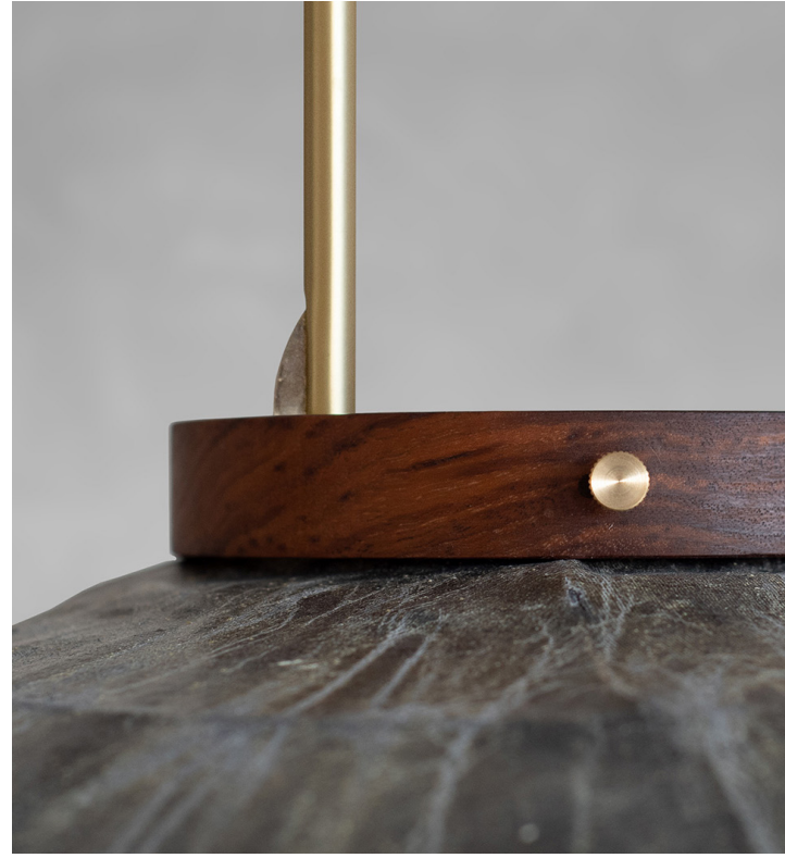
Bucket Lantern shown in Shui.