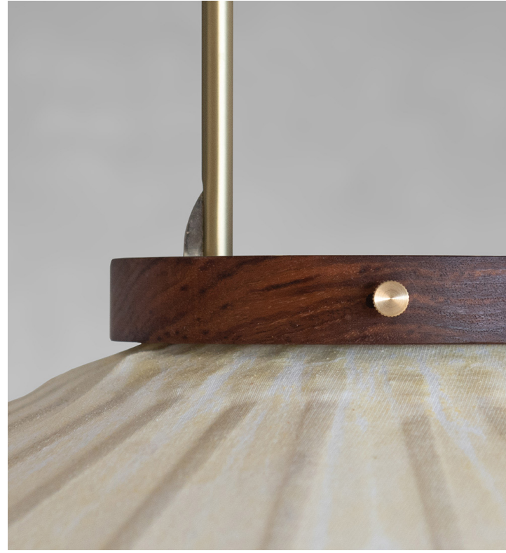
Bucket Lantern shown in Jin.