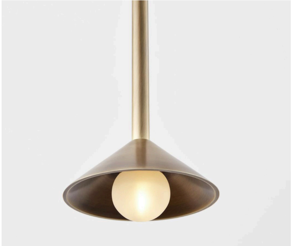
Baby Drop shown in Aged Brass finish.