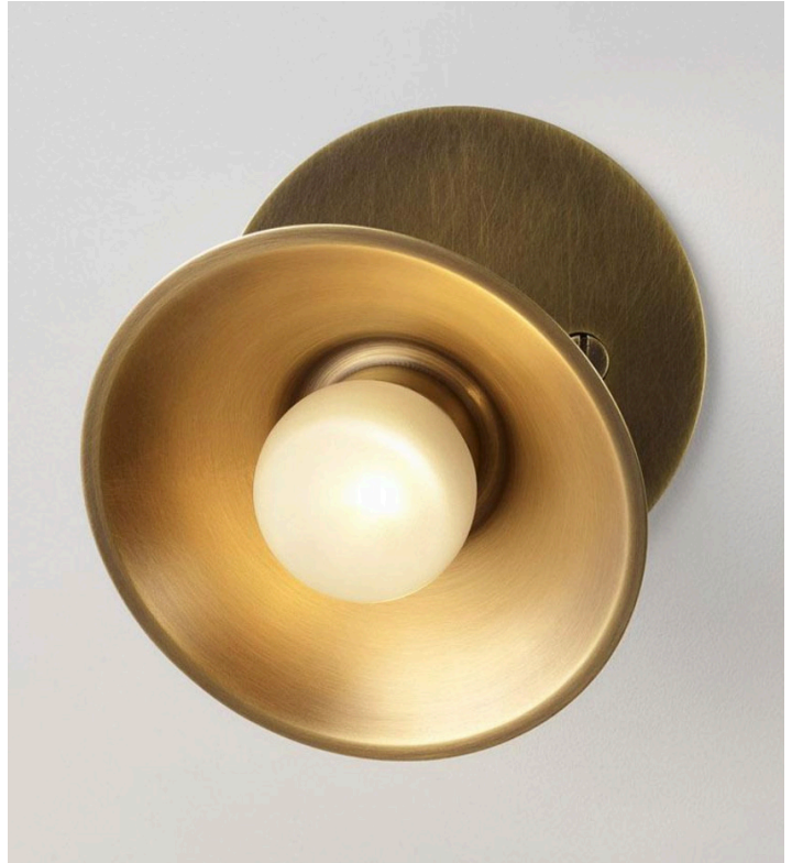
Baby Wall Swing shown in Aged Brass finish.