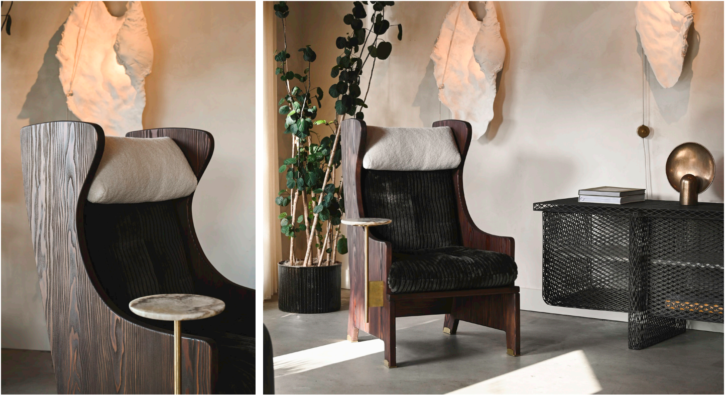
Herren Chair shown in Bark, Brass fittings, Onyx Top, Velvet Cushions and Cotton Pillow.