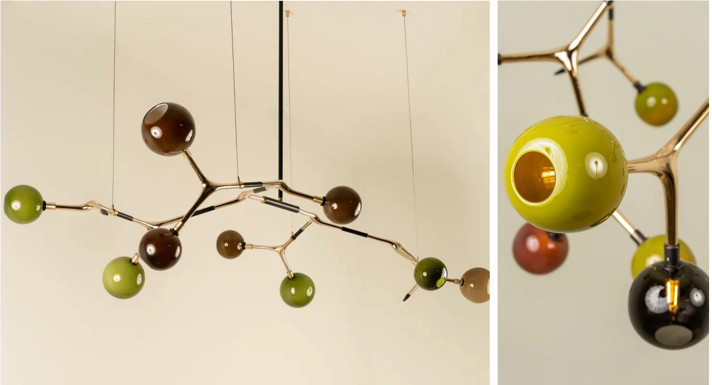
Mantis 9 chandelier shown in Bronze, Brass, Blown Glass Globes.