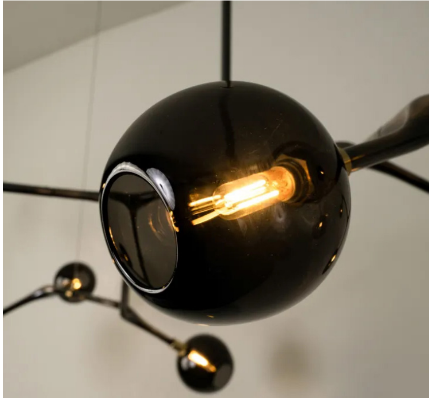
Maratus 12 chandelier shown in Bronze, Brass, Blown Glass Globes.