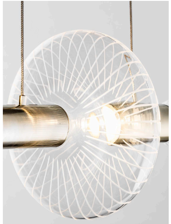
Cipher Horizontal S Pendant shown in Clear.