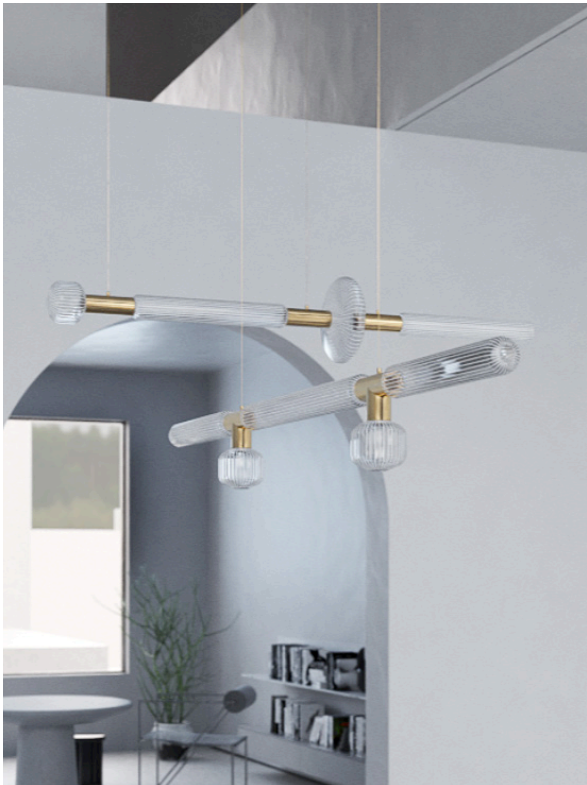
Cipher Horizontal L Pendant shown in Clear.