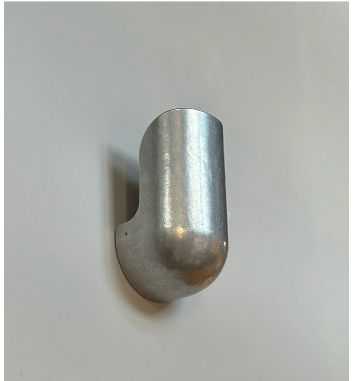
Elbow Wall Light (Wide) shown in Brass (left), Aluminum (right).