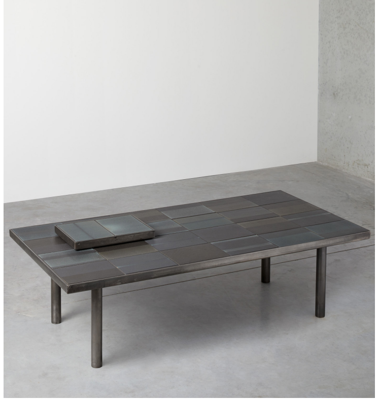
Teableaux II shown in Structured Flux Wash to Black Stoneware Glaze. Designed by Bruce Rowe for Anchor Ceramics.