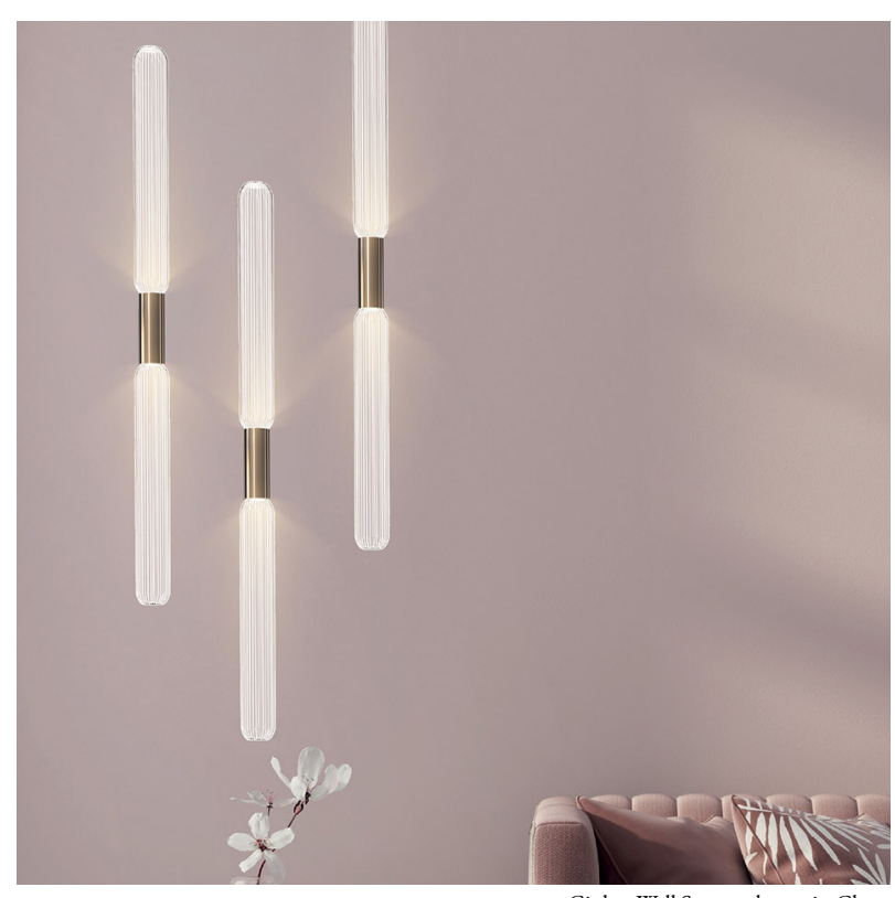
Cipher Wall Sconce shown in Clear.