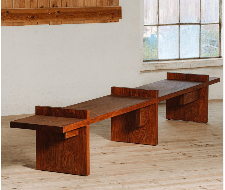
Bacon Bench shown in Natural Oiled Bubinga Wood. Designed by Vasco Mendes.