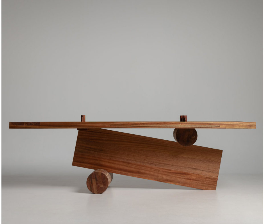
Bacon Dining Table shown in Mahogany. Designed by Vasco Mendes.