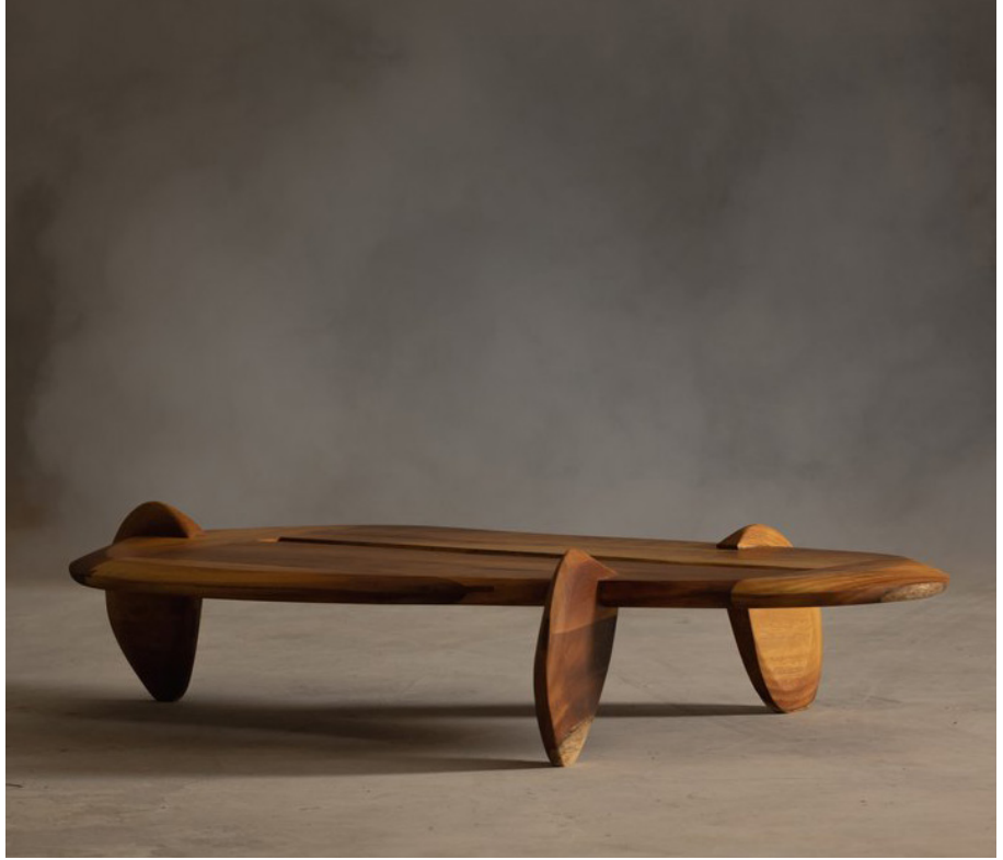
Balanced Void Coffee Table shown in Iroko. Designed by Vasco Mendes.