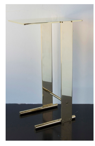
Polished Unlacquered Brass (PUB)