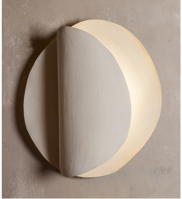
Onde #2 shown in Ceramic. Designed by Ash Design.