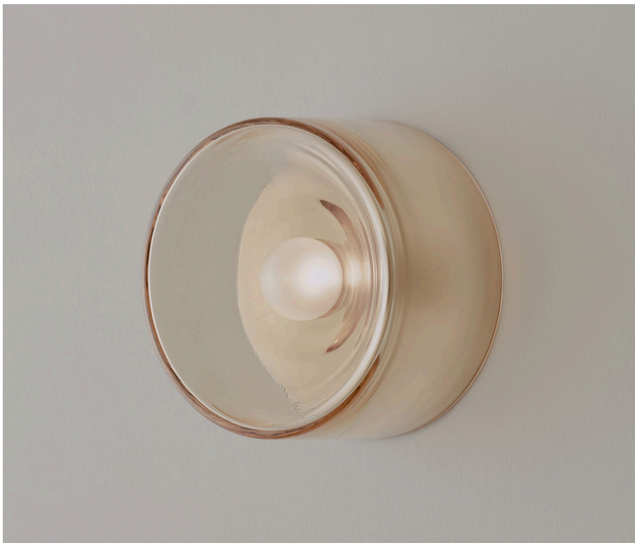
Blown Glass Anton.