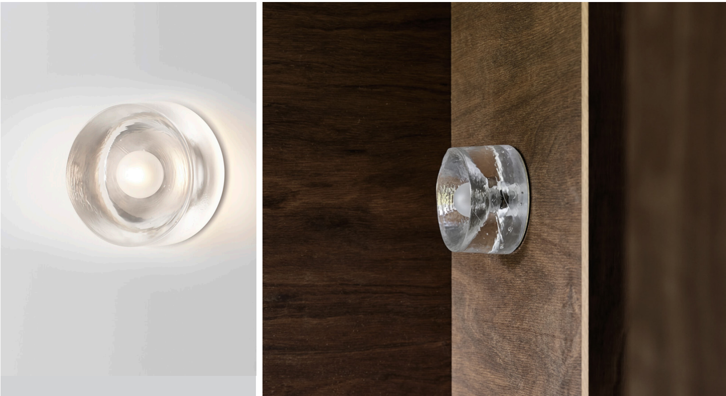
Cast Glass Anton Mini.

stahlandband.com info@stahlandband.com 424.228.4134