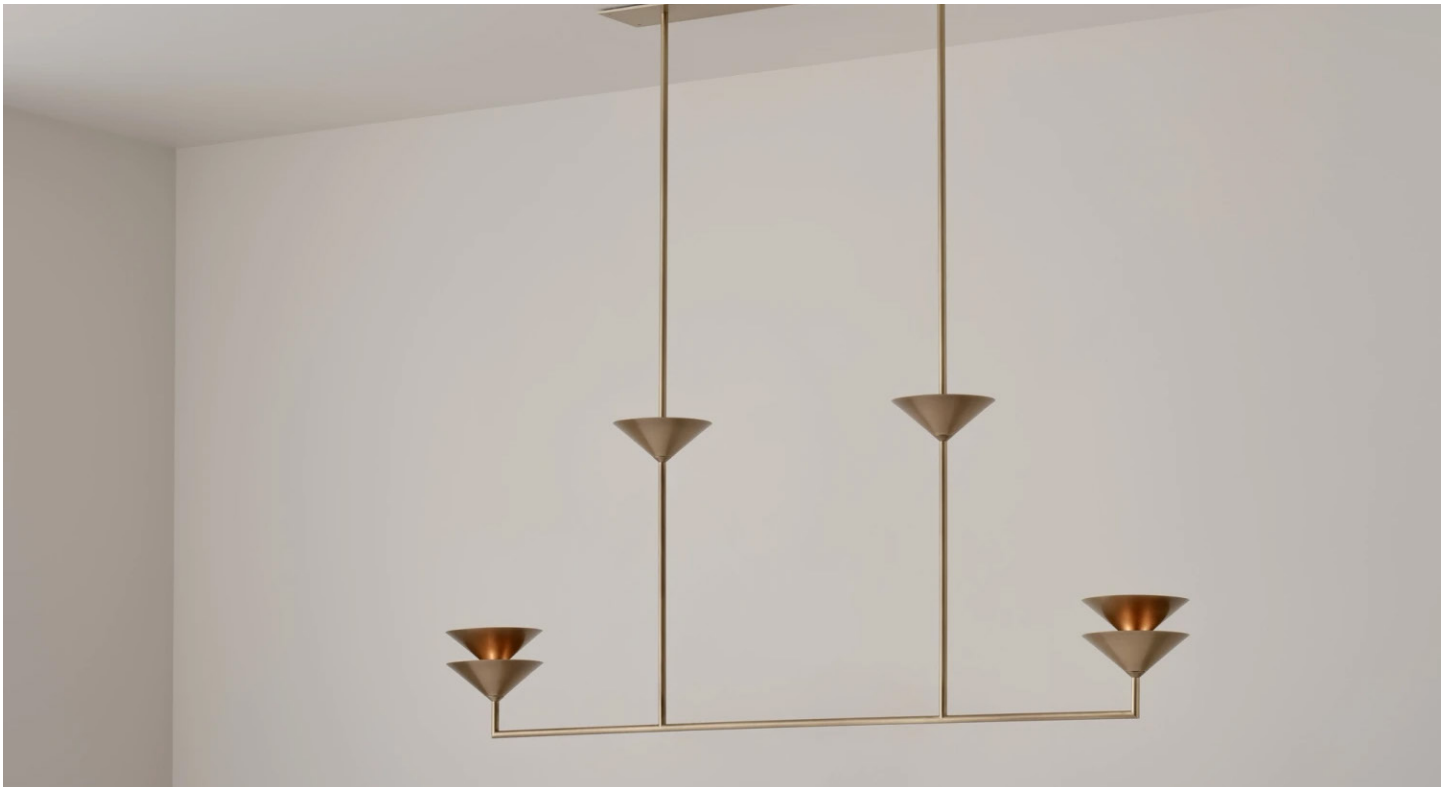
Balanced Stack shown in Aged Brass finish.

stahlandband.com info@stahlandband.com 424.228.4134