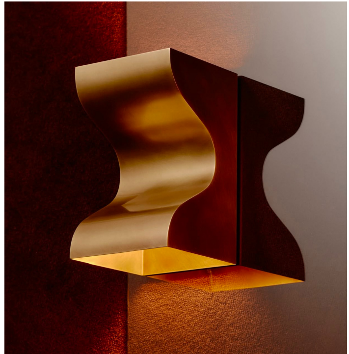
Buckle Sconce - Brass by Völker Haug Studio.